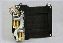
Shutter unit of the FS-1

A newly created vertical travel metallic shutter uses two micro solenoids, eliminating many mechanical gears, springs, lever and linkages. The FS-1 shutter is CPU controlled for extremely accurate shutter speeds.