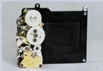
Conventional mechanical shutter